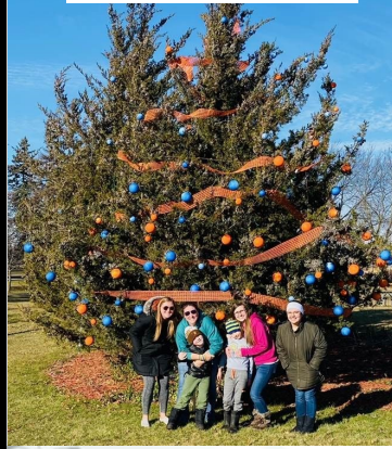
We decorated a tree on Stephenson Island for Operation Light the Island!