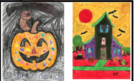
Congratulations to the 4 artists for each age group that won our coloring contest! Thank you to all artists that participated!