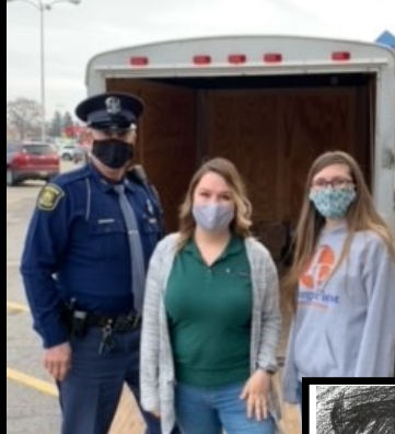
Participated in Stuff a Blue Goose!