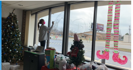
Getting offices ready for the holidays!