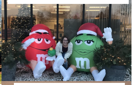
Passing out 100 Grand candy bars for International Credit Union Day